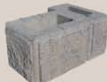
CORNER (L/R) WITH 833 UTILITY